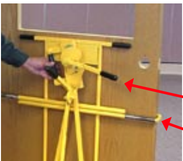
The Lift Handle will lift the Door from 1/4th of an inch to 2 inches off the floor.