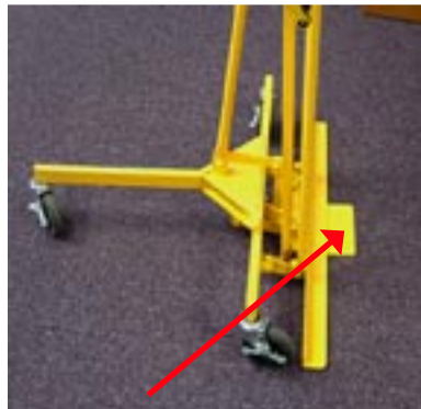
The Floor Plate moves out to support the door when in plumb or past plumb position.