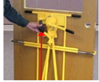
The Side Tilt Adjustment Wheel adjusts the door from Right (2°) to left (2°) on either side of plumb.