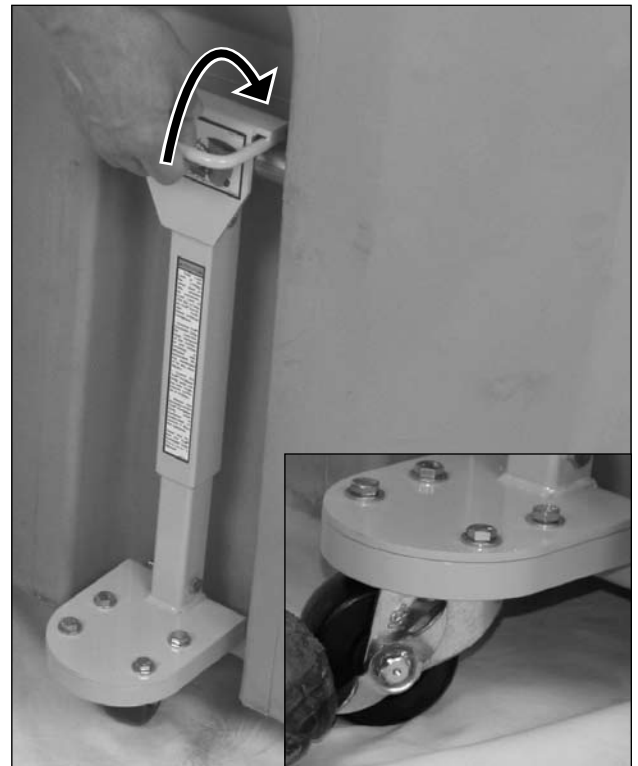
3) Secure the top hook of the Troll® EZ Wheel™ over the bar on the container. ALWAYS set the brake when the container is unattended or remove the Troll® EZ Wheel™ from the container.